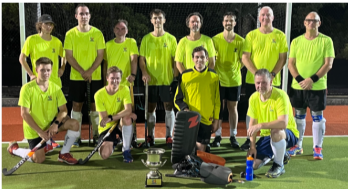
#NDHL8 Summer Hockey Premiers Research Rebels!!